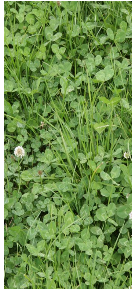
Estimated 20-30% clover content.