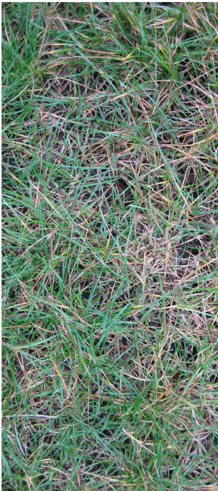
Estimated 0% clover content.

Helpful tip: Highlight poor clover paddocks on a farm map. These photos below will help you assess relative clover content in different paddocks. .