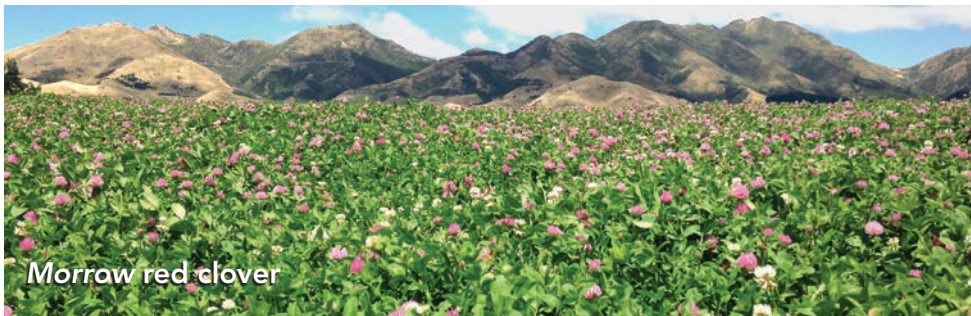
Morrow red clover