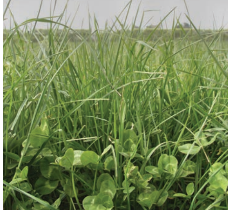
Redefine (top) makes friends with legumes unlike old cocksfoot.

Captain plantain Meet the cool season plantain bred for feed when you need it most. Drought tolerant, with plenty of summer growth too, Captain also has properties to reduce nitrogen leaching.