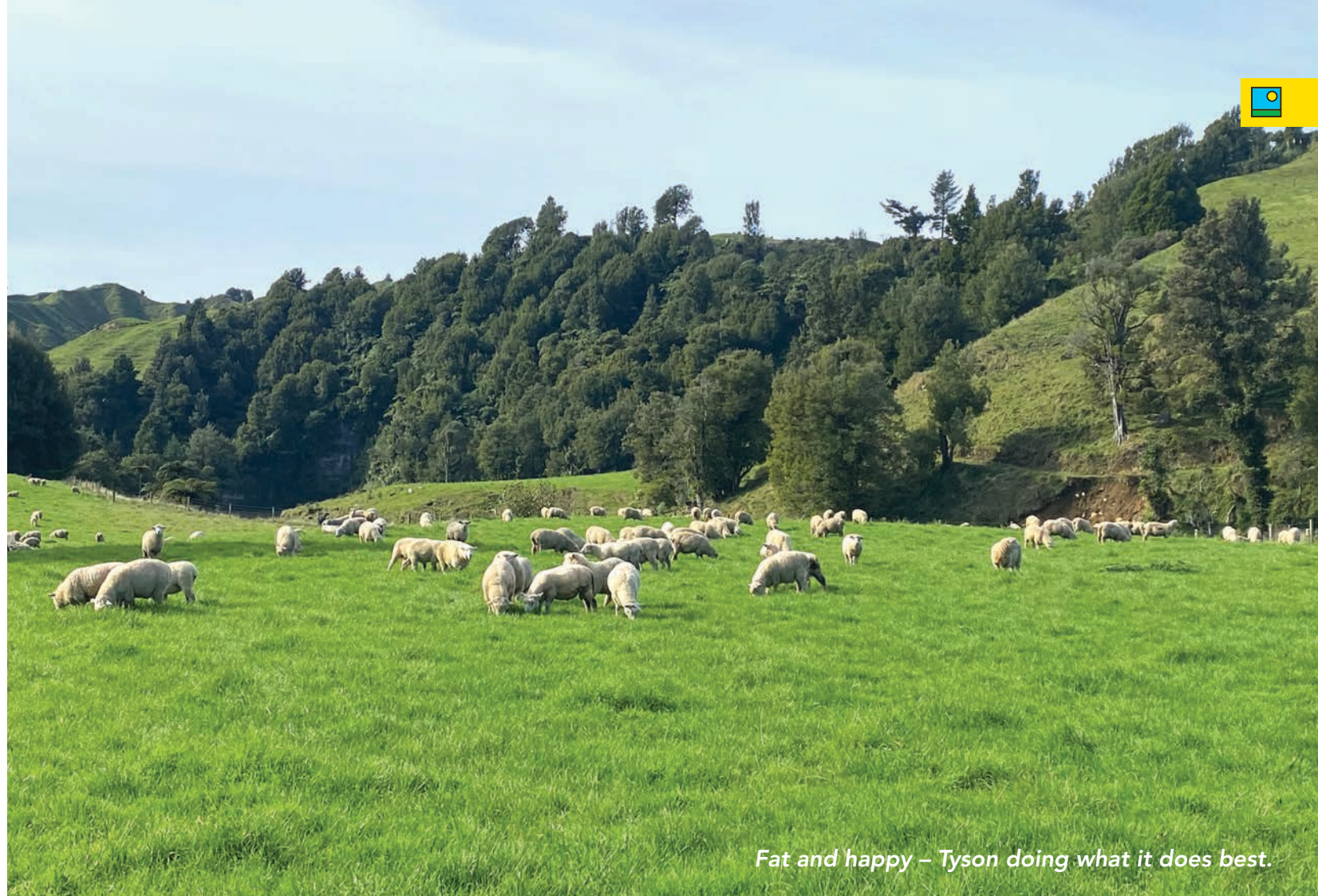
Fat and happy – Tyson doing what it does best.

a bit longer and animals will still scoff it up and thrive, producing more off your existing land, for the same amount of nitrogen.